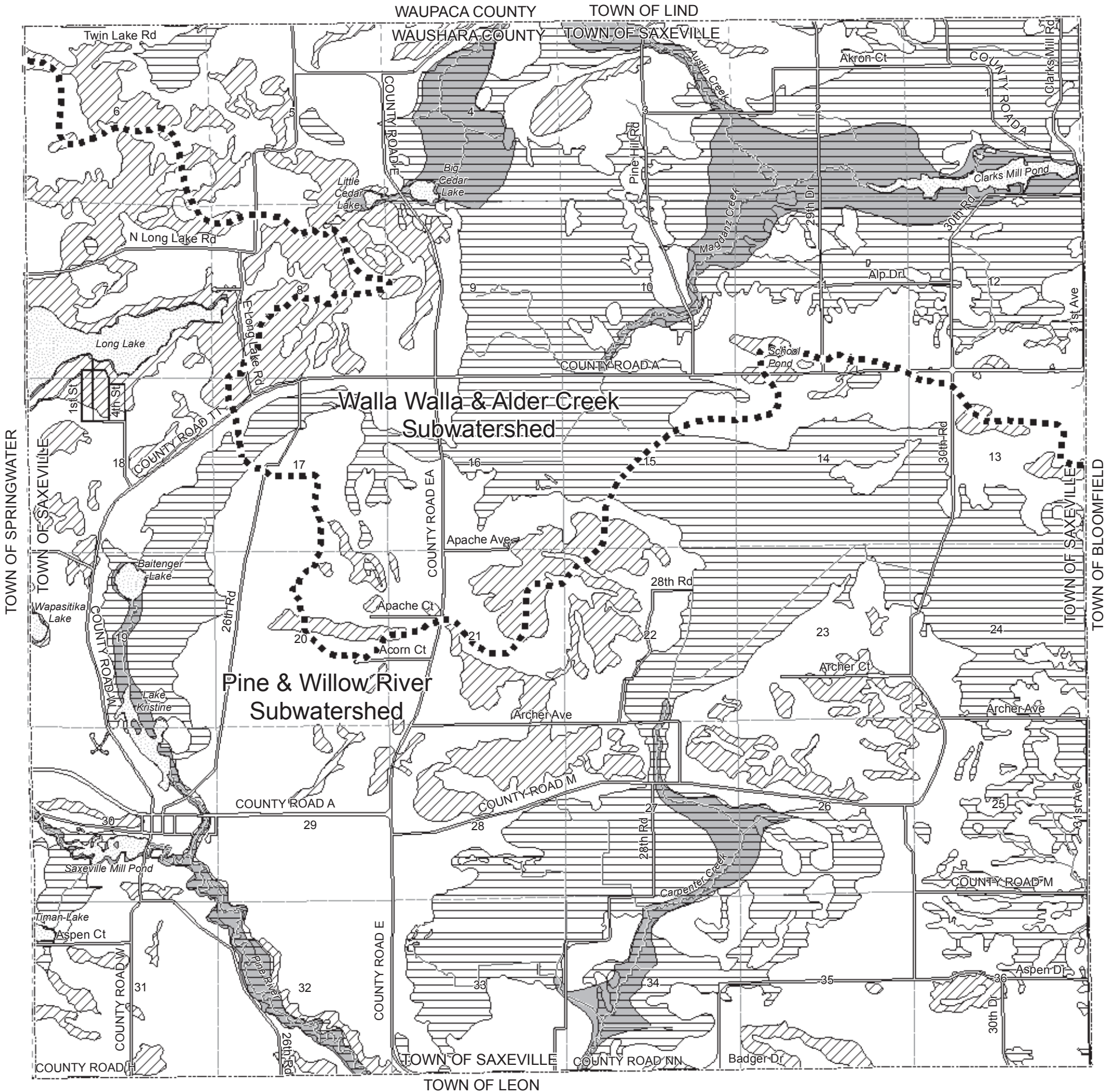
EXHIBIT 5-5 TOWN OF SAXEVILLE ENVIRONMENTAL FEATURES