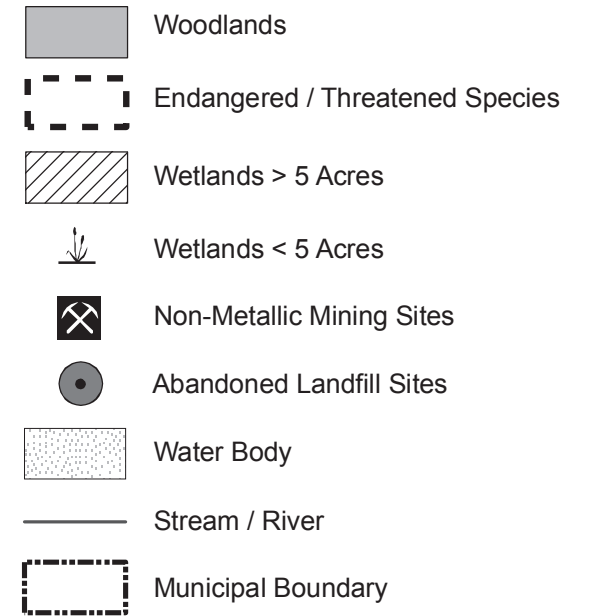
EXHIBIT 5-6 VILLAGE OF HANCOCK ENVIRONMENTAL FEATURES