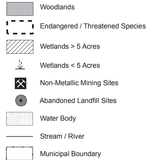
EXHIBIT 5-6 TOWN OF OASIS ENVIRONMENTAL FEATURES