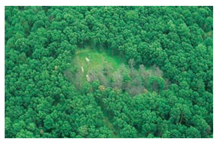
Example 2b. This aerial view shows the characteristic pocket of dead trees, a hallmark of oak wilt.

In Michigan, mail to: State Pathologist Michigan Dept. of Agriculture Laboratory Division 1615 Harrison Rd. East Lansing, MI 48823 (517) 337-5091