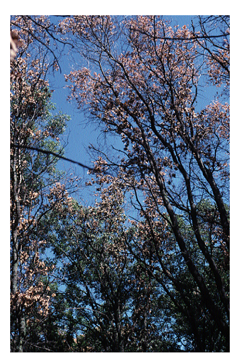
Example 3c. Crown wilt indicates the presence of oak wilt.

tracked or rubbertired vehicle with a vibrating head attached at the rear. A knife-like plow blade with a slight hook at the bottom is attached to the vibrating head. The blade is pulled horizontally through the