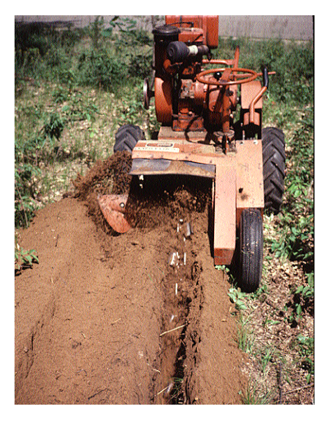
Example 3b. Oak wilt trenching.

As oaks die, the open spaces and dead trees can provide valuable feeding and nesting sites for wildlife. When overstory trees die, the site often becomes brushy for about ten years. Warblers, grosbeaks, cuckoos, cardinals, grouse, rabbits, deer and shrews will be attracted to the brushy area. Brown creepers may nest under the sloughing bark on dead trees. Dead trees will furnish insects for birds, and larger specimens may provide perches for