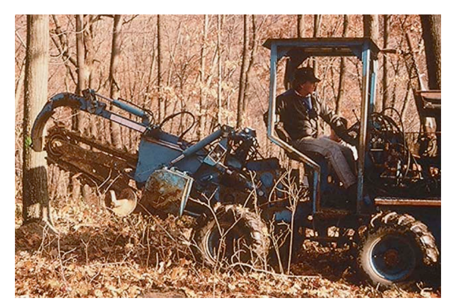
Example 3d. A trencher is a rubber-tired vehicle with a digging chain attached to the back. The chain moves along a boom, digging a trench and breaking root grafts as it is pulled through the soil.

You must install root barriers before trees in the pocket of wilting trees are removed. Water tension released when live wilting trees are felled permits fluids to move rapidly to grafted healthy trees beyond the intended barrier. Remove all dead trees with the bark attached and all apparently healthy trees from inside the barrier (all trees over 3 in. in diameter should be removed). Apply an herbicide registered for treating cut oak stumps to prevent sprouting and minimize the chance of roots regrafting across the barrier. If you do not use an herbicide, sprouts may continue to keep the disease active in the pocket, posing a risk to trees outside the barrier. Remove trees and treat stumps after placing the barrier and before the following April (when fungal mats may form). You do not need to remove trees with loose bark since they can no longer produce fungal mats.