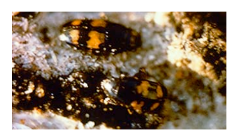
Example 1b. Fungal mats force the bark to crack open. The mats' odor attracts sapfeeding beetles which spread the disease to healthy trees.