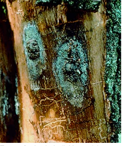
Example 1a. In April, May and June, fungal mats ("pressure pads") grow under the bark of trees that wilted the previous summer. Mats are sometimes present in late summer or fall.

Underground spread of oak wilt from infected to healthy trees occurs through oak roots graft more commonly than do white oak roots, and grafts between red