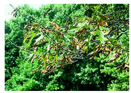
Example 1c. The fungus invades the tree's water-carrying system, causing leaves to wilt and fall. Wilting occurs most often in July and August, and occasionally in spring or fall.