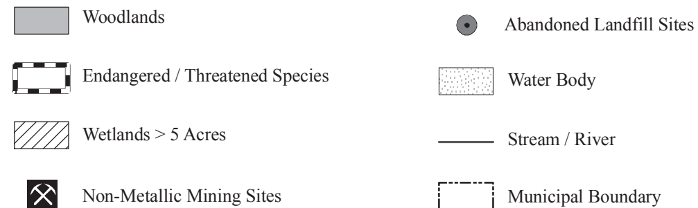
EXHIBIT 5-6 ENVIRONMENTAL FEATURES